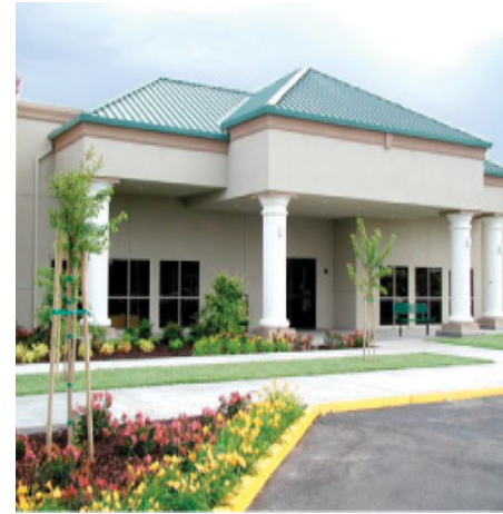
Paradise Medical Office Residency Training Facility